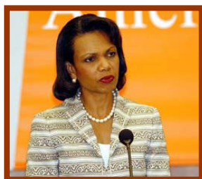
Condoleezza Rice US Secretary of State, is concerned about Sri Lankan Human Rights.

LTTE is providing false information to politicians, media and NGO's.