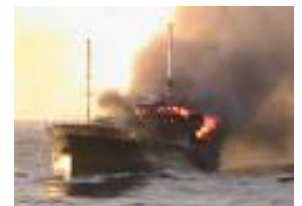
The sinking of the LTTE commercial fleet is a victory for the global war on terror and drugs

It is important the world community do not forget the sacrifices made by the brave men and women in the Sri Lankan forces benefits the global war on terror and drugs.